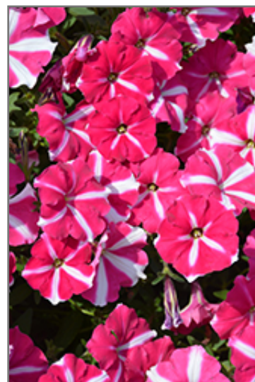
Hurrah Rose Star Petunia flowers

Hurrah Rose Star Petunia is recommended for the following landscape applications;