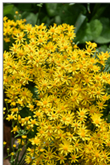
Golden Ragwort flowers

Golden Ragwort is recommended for the following landscape applications;