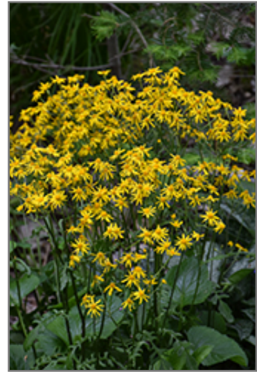
Golden Ragwort flowers

Golden Ragwort will grow to be about 12 inches tall at maturity extending to 24 inches tall with the flowers, with a spread of 12 inches. When grown in masses or used as a bedding plant, individual plants should be spaced approximately 10 inches apart. It grows at a medium rate, and under ideal conditions can be expected to live for approximately 10 years. As an herbaceous perennial, this plant will usually die back to the crown each winter, and will regrow from the base each spring. Be careful not to disturb the crown in late winter when it may not be readily seen!