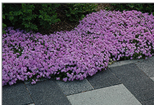
Fort Hill Moss Phlox in bloom