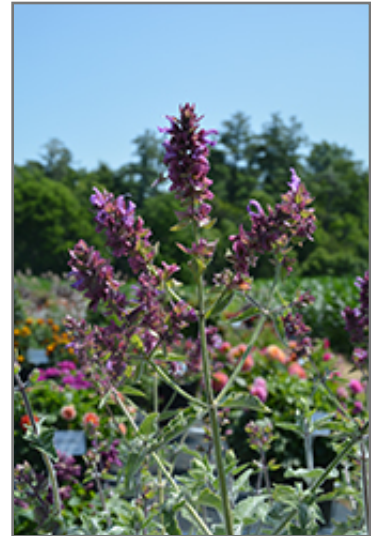
Lancelot Canary Island Sage flowers

Lancelot Canary Island Sage is recommended for the following landscape applications;