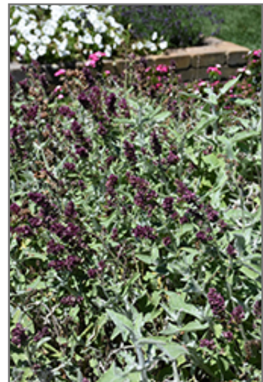
Lancelot Canary Island Sage in bloom