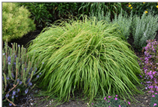
Prairie Winds Lemon Squeeze Fountain Grass

This is a relatively low maintenance plant, and is best cleaned up in early spring before it resumes active growth for the season. Deer don't particularly care for this plant and will usually leave it alone in favor of tastier treats. It has no significant negative characteristics.