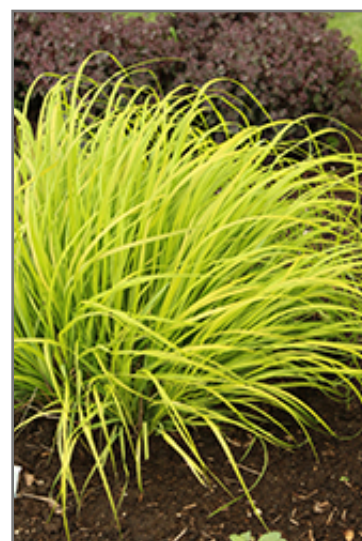
Prairie Winds Lemon Squeeze Fountain Grass