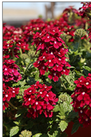
EnduraScape Burgundy Verbena flowers