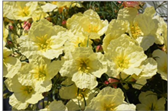
Ladybird Lemonade Texas Primrose flowers