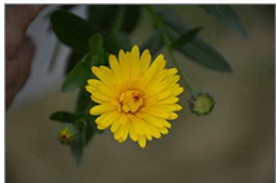
Lady Godiva Yellow Marigold flowers