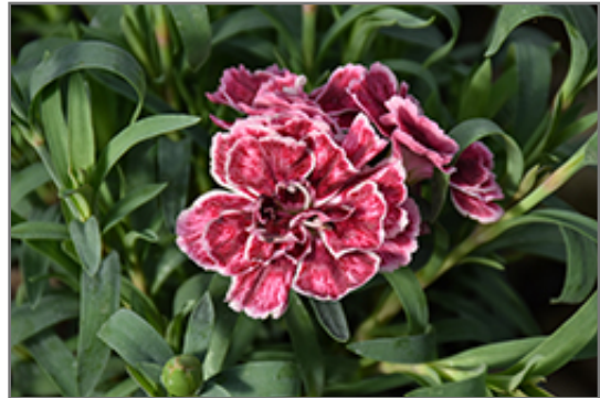
Constant Beauty Crush Burgundy Pinks flowers

Constant Beauty Crush Burgundy Pinks is recommended for the following landscape applications;