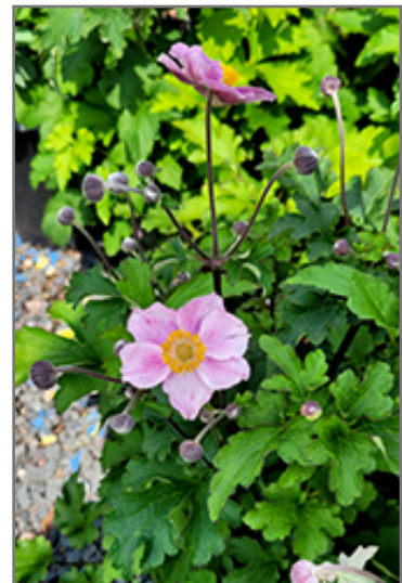
Pink Saucer Anemone flowers