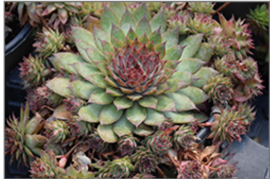
Chick Charms Butterscotch Baby Hens And Chicks