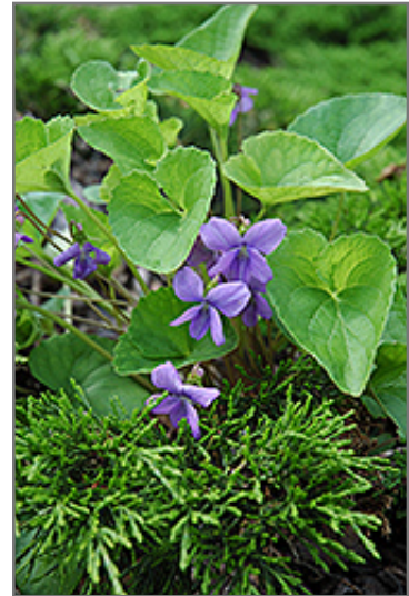
Wooly Blue Violet flowers