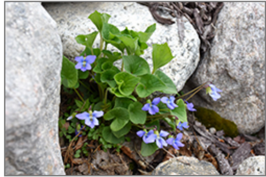
Wooly Blue Violet in bloom

Wooly Blue Violet will grow to be only 4 inches tall at maturity extending to 6 inches tall with the flowers, with a spread of 6 inches. When grown in masses or used as a bedding plant, individual plants should be spaced approximately 5 inches apart. Its foliage tends to remain low and dense right to the ground. It grows at a fast rate, and under ideal conditions can be expected to live for approximately 3 years. As an herbaceous perennial, this plant will usually die back to the crown each winter, and will regrow from the base each spring. Be careful not to disturb the crown in late winter when it may not be readily seen!