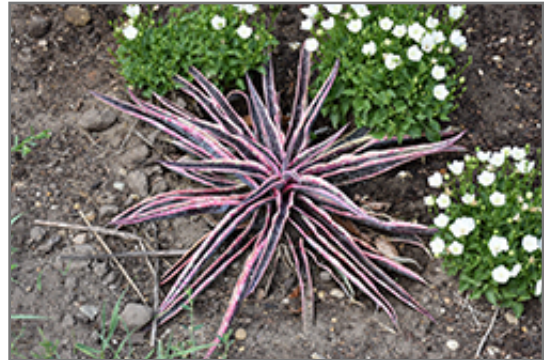
Art Deco Mangave