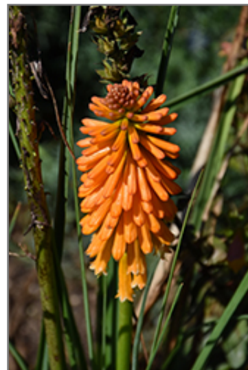
Pyromania Orange Blaze Torchlily flowers