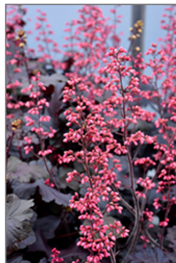
Timeless Night Coral Bells flowers

Timeless Night Coral Bells is recommended for the following landscape applications;