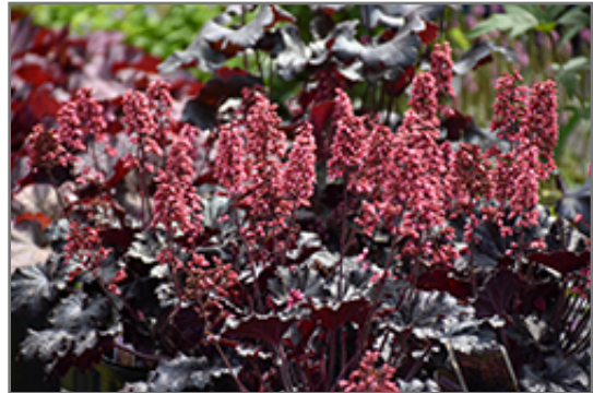
Timeless Night Coral Bells flowers

Timeless Night Coral Bells will grow to be about 10 inches tall at maturity extending to 18 inches tall with the flowers, with a spread of 18 inches. When grown in masses or used as a bedding plant, individual plants should be spaced approximately 16 inches apart. Its foliage tends to remain low and dense right to the ground. It grows at a medium rate, and under ideal conditions can be expected to live for approximately 10 years. As an evergreen perennial, this plant will typically keep its form and foliage year-round.