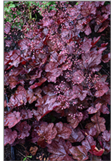
Carnival Burgundy Blast Coral Bells flowers

Carnival Burgundy Blast Coral Bells is recommended for the following landscape applications;