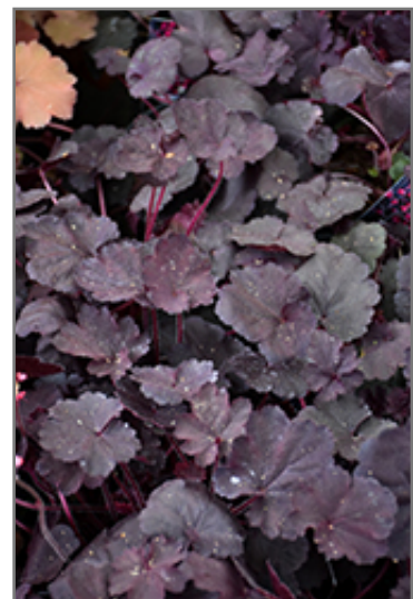
Black Forest Cake Coral Bells foliage