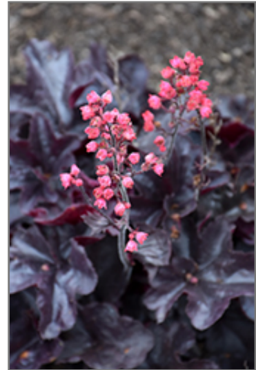
Black Forest Cake Coral Bells flowers

Black Forest Cake Coral Bells is recommended for the following landscape applications;