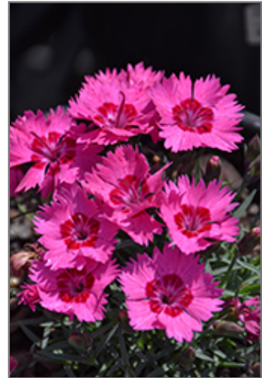
Paint The Town Fancy Pinks flowers

This plant is not reliably hardy in our region, and certain restrictions may apply; contact the store for more information.