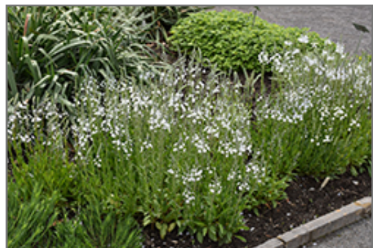
Gentian Speedwell flowers