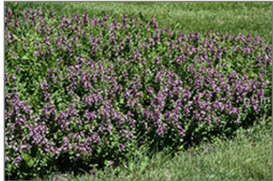
Pride Of Georgia Germander in bloom

This plant is not reliably hardy in our region, and certain restrictions may apply; contact the store for more information.