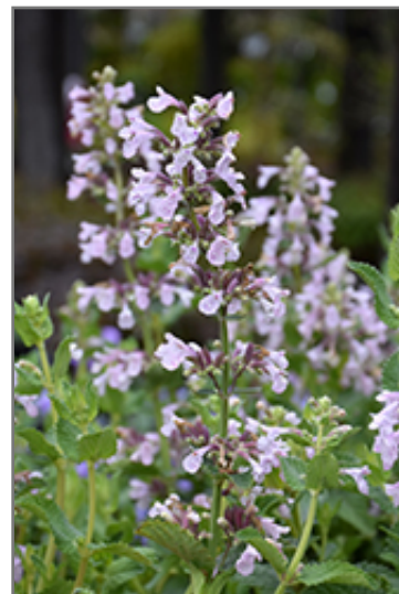
Whispurr Pink Catmint flowers