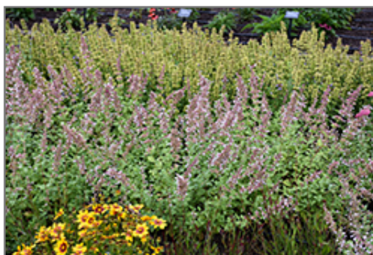
Whispurr Pink Catmint in bloom