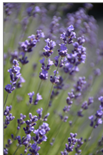
Fashionably Late Lavender flowers

Fashionably Late Lavender is recommended for the following landscape applications;