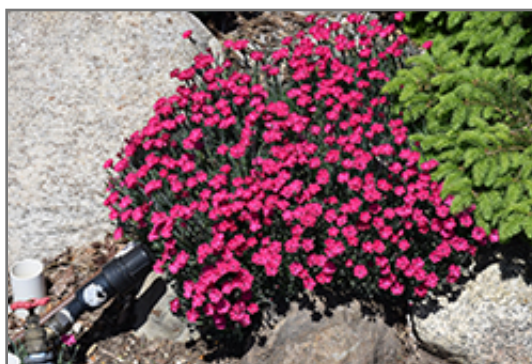
Paint The Town Red Pinks in bloom