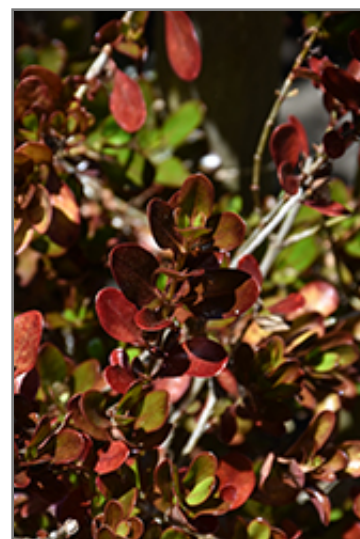
Karo Red Mirror Bush foliage