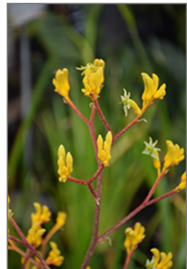
Yellow Gem Kangaroo Paw flower buds