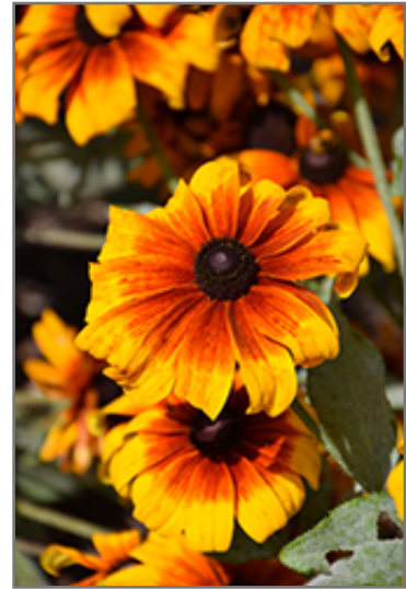
Rising Sun Chestnut Gold Coneflower flowers

This is a relatively low maintenance plant, and should be cut back in late fall in preparation for winter. It is a good choice for attracting butterflies to your yard, but is not particularly attractive to deer who tend to leave it alone in favor of tastier treats. It has no significant negative characteristics.