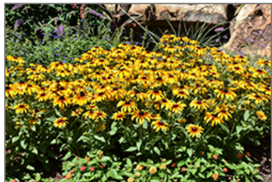
Rising Sun Chestnut Gold Coneflower in bloom