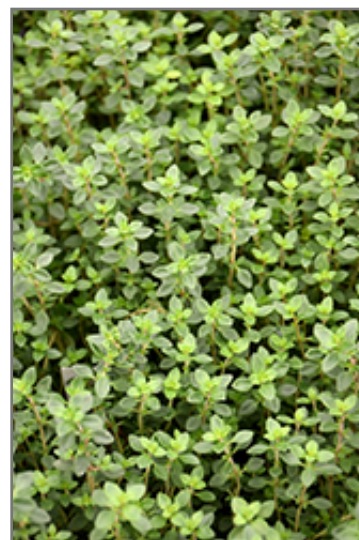
Lime Thyme foliage

This is a dense herbaceous evergreen perennial herb with a spreading, ground-hugging habit of growth. It brings an extremely fine and delicate texture to the garden composition and should be used to full effect. This plant will require occasional maintenance and upkeep, and is best cleaned up in early spring before it resumes active growth for the season. Deer don't particularly care for this plant and will usually leave it alone in favor of tastier treats. Gardeners should be aware of the following characteristic(s) that may warrant special consideration;