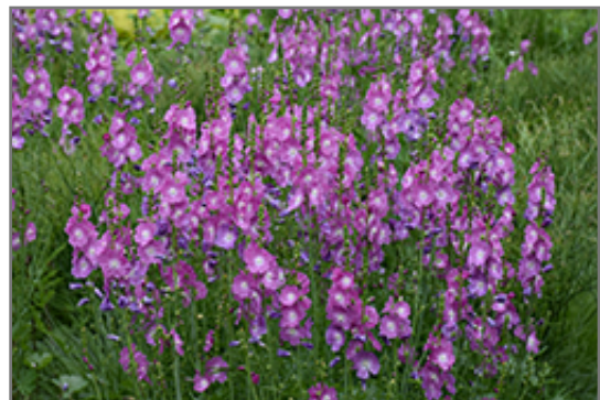
Stark's Hybrids Prairie Mallow flowers