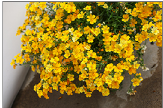
Nessie Plus Yellow Nemesis flowers

Nessie Plus Yellow Nemesis is recommended for the following landscape applications;