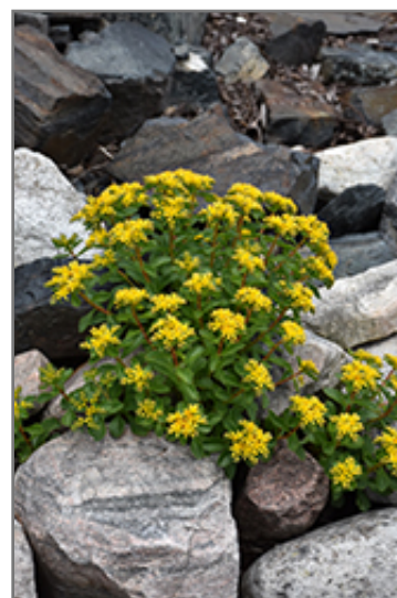
Russian Stonecrop in bloom