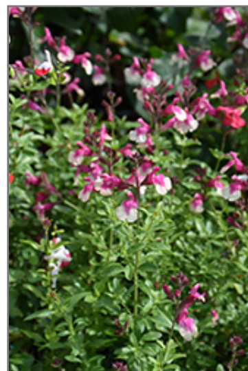
Mirage Rose Bicolor Autumn Sage flowers