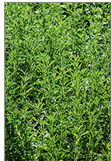
Winter Savory