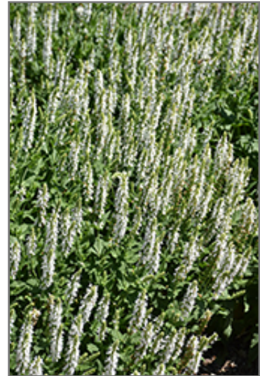
Snow Hill Sage flowers