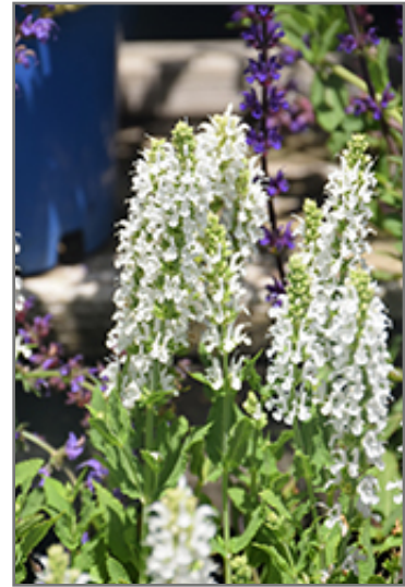
Snow Hill Sage flowers

This plant is not reliably hardy in our region, and certain restrictions may apply; contact the store for more information.