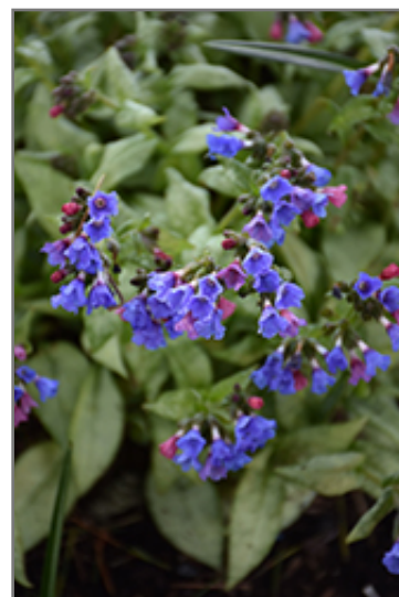
Cotton Cool Lungwort flowers