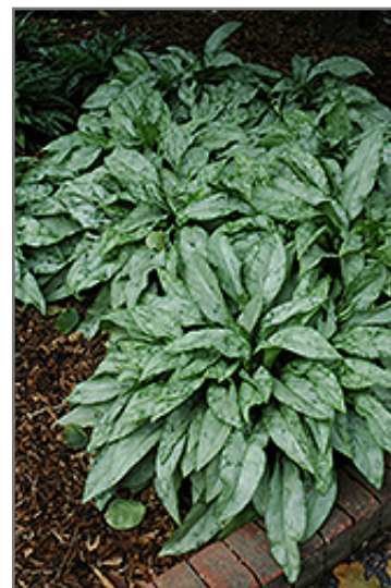
Cotton Cool Lungwort