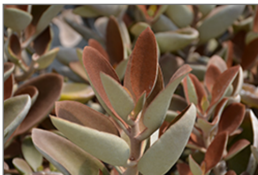
Copper Spoons foliage