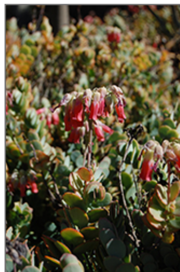
Marnier's Kalanchoe flowers

Marnier's Kalanchoe is recommended for the following landscape applications;