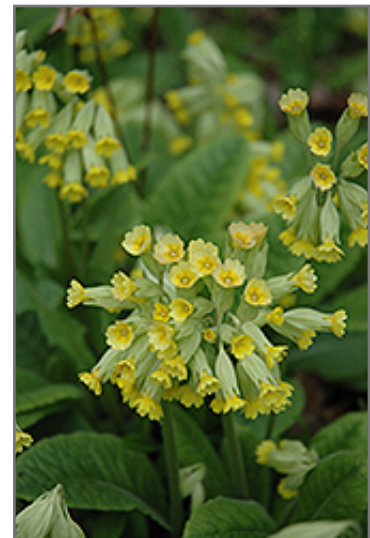
English Cowslip flowers