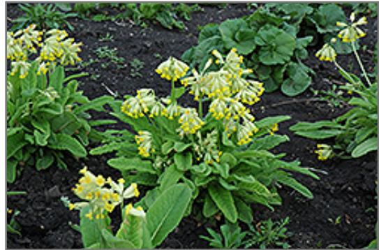
English Cowslip in bloom

English Cowslip will grow to be only 4 inches tall at maturity extending to 10 inches tall with the flowers, with a spread of 8 inches. When grown in masses or used as a bedding plant, individual plants should be spaced approximately 6 inches apart. Its foliage tends to remain low and dense right to the ground. It grows at a fast rate, and under ideal conditions can be expected to live for approximately 5 years. As an herbaceous perennial, this plant will usually die back to the crown each winter, and will regrow from the base each spring. Be careful not to disturb the crown in late winter when it may not be readily seen!