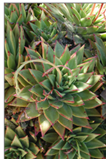
Molded Wax Echeveria foliage