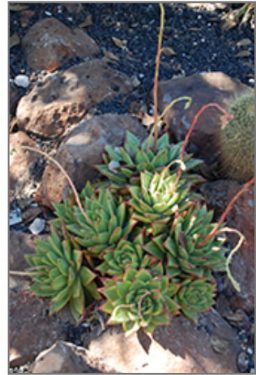
Molded Wax Echeveria

This plant is not reliably hardy in our region, and certain restrictions may apply; contact the store for more information.