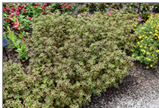
ColorBlaze Chocolate Drop Coleus