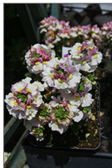
Essential Pinkberry Nemesia flowers