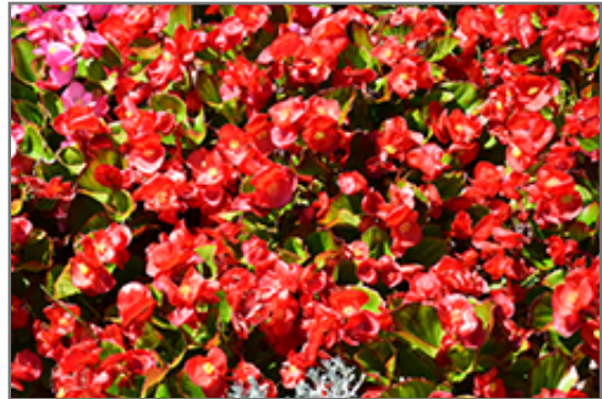
Sprint Plus Red Begonia flowers

Sprint Plus Red Begonia will grow to be about 9 inches tall at maturity, with a spread of 12 inches. Its foliage tends to remain low and dense right to the ground. This annual will normally live for one full growing season, needing replacement the following year.