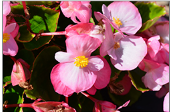
Sprint Plus Pink Begonia flowers