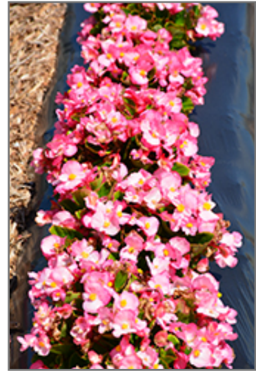
Sprint Plus Pink Begonia in bloom

Sprint Plus Pink Begonia is a fine choice for the garden, but it is also a good selection for planting in outdoor containers and hanging baskets. It is often used as a 'filler' in the 'spiller-thriller-filler' container combination, providing a mass of flowers against which the thriller plants stand out. Note that when growing plants in outdoor containers and baskets, they may require more frequent waterings than they would in the yard or garden.