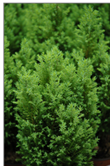
Ellwood's Gold Lawson Falsecypress foliage