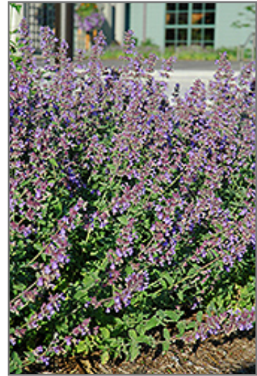
Walker's Low Catmint flowers

Walker's Low Catmint is a fine choice for the garden, but it is also a good selection for planting in outdoor pots and containers. It is often used as a 'filler' in the 'spiller-thriller-filler' container combination, providing a mass of flowers against which the thriller plants stand out. Note that when growing plants in outdoor containers and baskets, they may require more frequent waterings than they would in the yard or garden. Be aware that in our climate, most plants cannot be expected to survive the winter if left in containers outdoors, and this plant is no exception. Contact our experts for more information on how to protect it over the winter months.