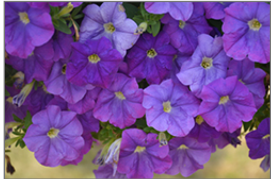
Sanguna Light Blue Petunia flowers

Sanguna Light Blue Petunia is recommended for the following landscape applications;