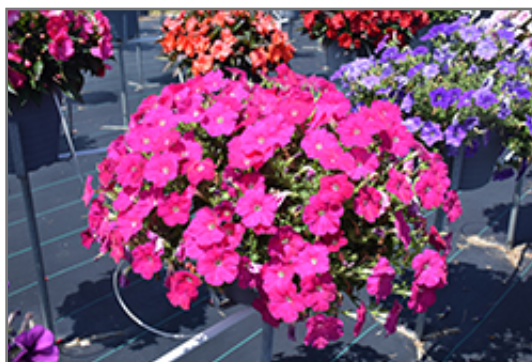
Sanguna Hot Rose Petunia in bloom