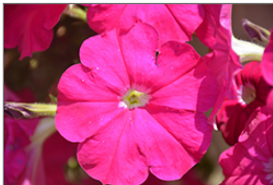
Sanguna Hot Rose Petunia flowers

Sanguna Hot Rose Petunia is recommended for the following landscape applications;