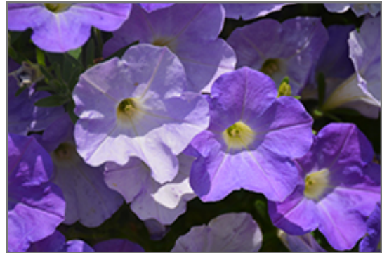
Dekko Sky Blue Petunia flowers

Dekko Sky Blue Petunia will grow to be about 12 inches tall at maturity, with a spread of 22 inches. When grown in masses or used as a bedding plant, individual plants should be spaced approximately 18 inches apart. Its foliage tends to remain dense right to the ground, not requiring facer plants in front. This fast-growing annual will normally live for one full growing season, needing replacement the following year.