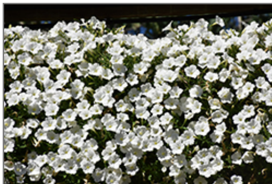
ColorRush White Petunia in bloom

ColorRush White Petunia is recommended for the following landscape applications;