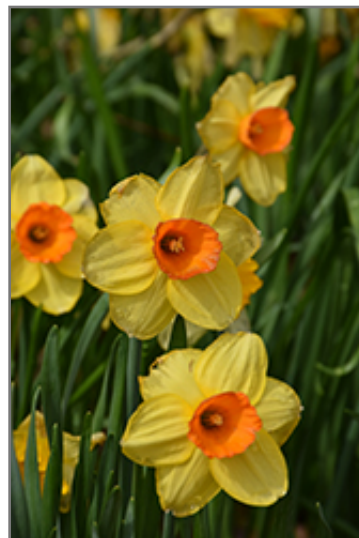
Fortissimo Daffodil flowers