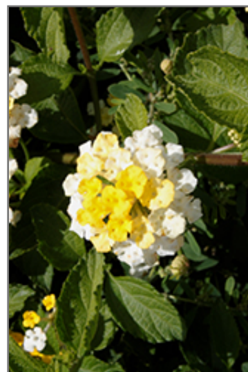
Landscape Bandana Lemon Zest Lantana flowers