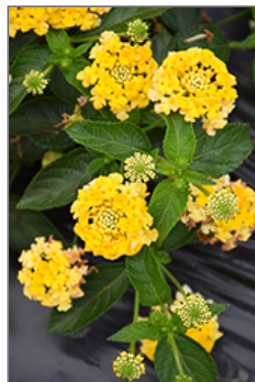
Landscape Bandana Lemon Zest Lantana flowers

Landscape Bandana Lemon Zest Lantana is a fine choice for the garden, but it is also a good selection for planting in outdoor containers and hanging baskets. Because of its spreading habit of growth, it is ideally suited for use as a 'spiller' in the 'spiller-thriller-filler' container combination; plant it near the edges where it can spill gracefully over the pot. Note that when growing plants in outdoor containers and baskets, they may require more frequent waterings than they would in the yard or garden.